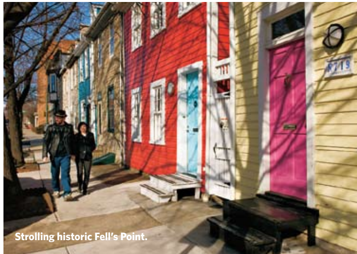
Strolling historic Fell's Point.

Keep on Eastern to South Broadway, where you're on the edge of a growing Latino enclave unofficially called Spanish Town. Head up Broadway to the 8 taco trucks flanking both sides of the road. "Ask any chef in the area about the taco trucks, and you'll see a big smile," says Lars Rusins, president of the Baltimore Foodies club. "The best one is parked in front of the church on the east side. I always order tres tacos lengua [beef tongue]." Follow Broadway south to Fleet