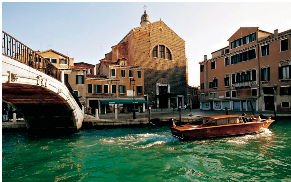
Walk this way: In this city of canals, an amble with frequent stops is the best way to see the sights.