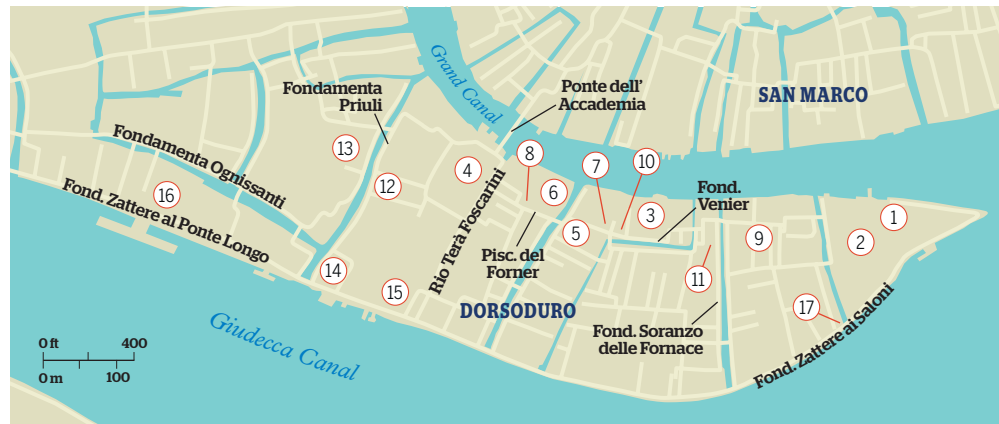
STEFANO AMANTINI/CORBIS (UPPER), OLIMPIO FANTUZZI/SIME (LOWER), INTERNATIONAL MAPPING