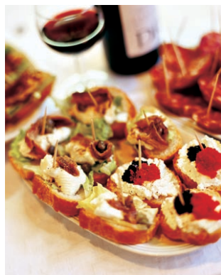
A plate of cicchetti , or small bites.

BITES AND SIPS Take a break from perambulating to quaff wine and nibble Venetian tapas known as cicchetti at the